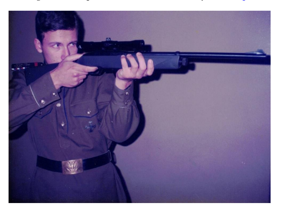
Fig. 6. During sports shooting classes. November 1996

According to the "Vestnik Leib-Gvardii" newspaper No. 12 for 1997, the similar classes were conducted in February 1997, both as part of the educational process and in connection with the working visit of a representative from Nalchik city (Budni i prazdniki, 1997a: 2-3).