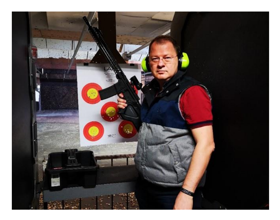
Fig. 14. On the firing line with an AR-15 rifle. March 12, 2020

The shooting was carried out with a standard NATO cartridge of 5.56 mm caliber (Figure 15).