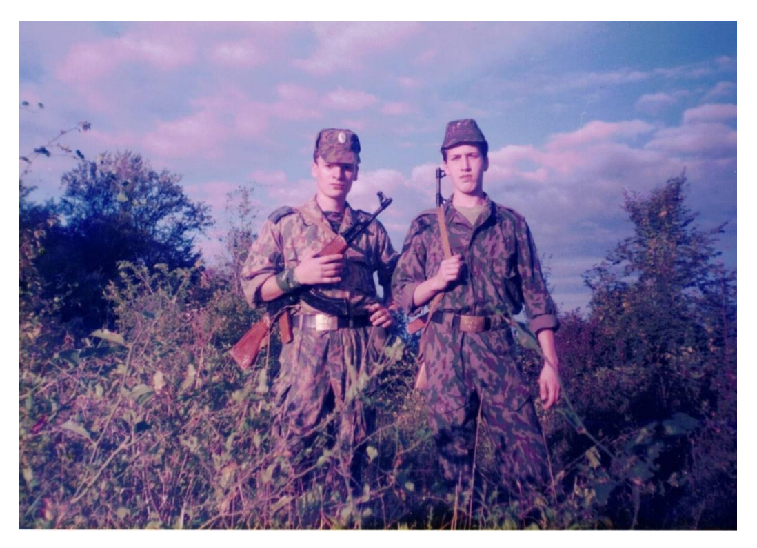
Fig. 5. Participants of the Second field exit under the Semyonovsky Spire Mountain

In the "Vestnik Leib-Gvardii" newspaper No. 10 for 1996 in the section "Weekdays and holidays of the district" it was noted that from September to November 1996 there were 3 field exits: two to the Semenovsky spire and one to the Agur waterfalls. During field exits, fire training was carried out too (Budni i prazdniki, 1996: 2).