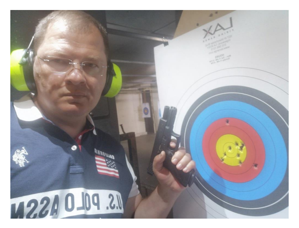
Fig. 16. The best target from a Glock pistol. March 23, 2020

As for the Glock pistol, both 9 and 10 mm pistols were used during the shooting (Figure 16).