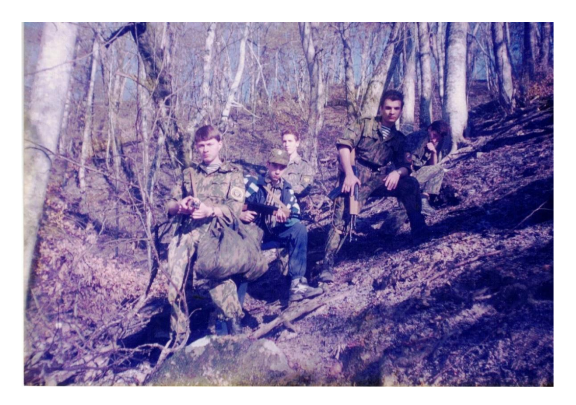
Fig. 4. Tactical exercises during the second field trip