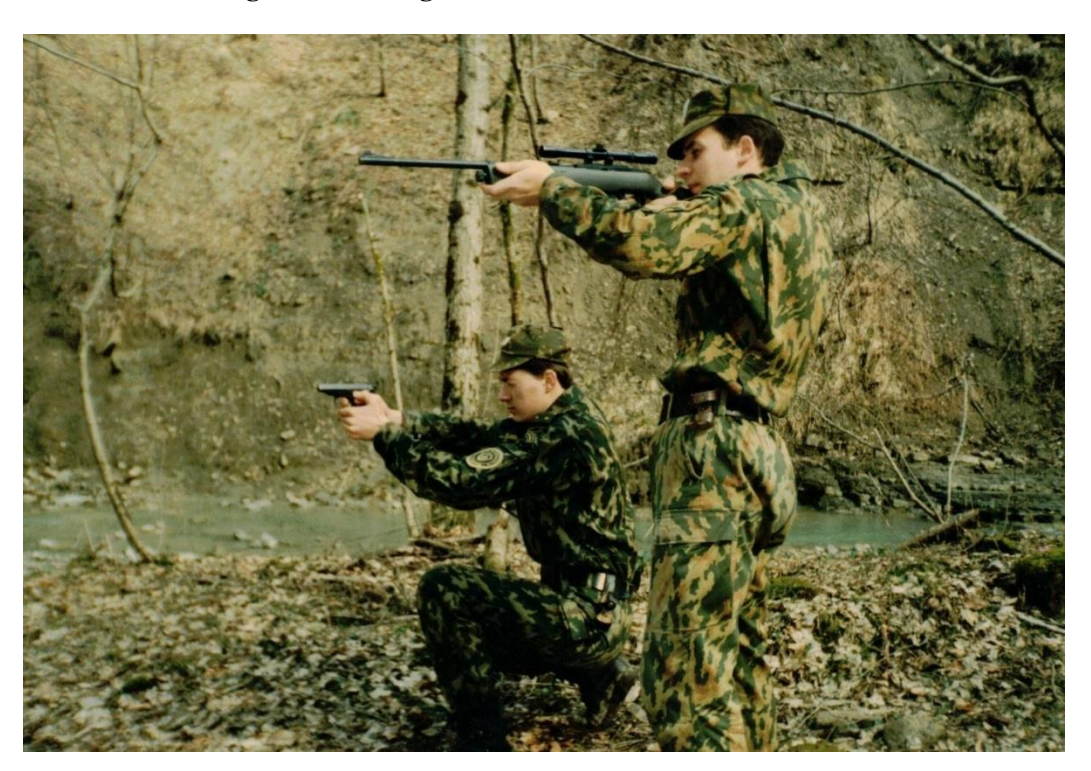
Fig. 11. Firing line during the next field exit

Here is an example of another firing line (Figure 11), as in Figure 10, the two shooting stances are used: standing and kneeling.