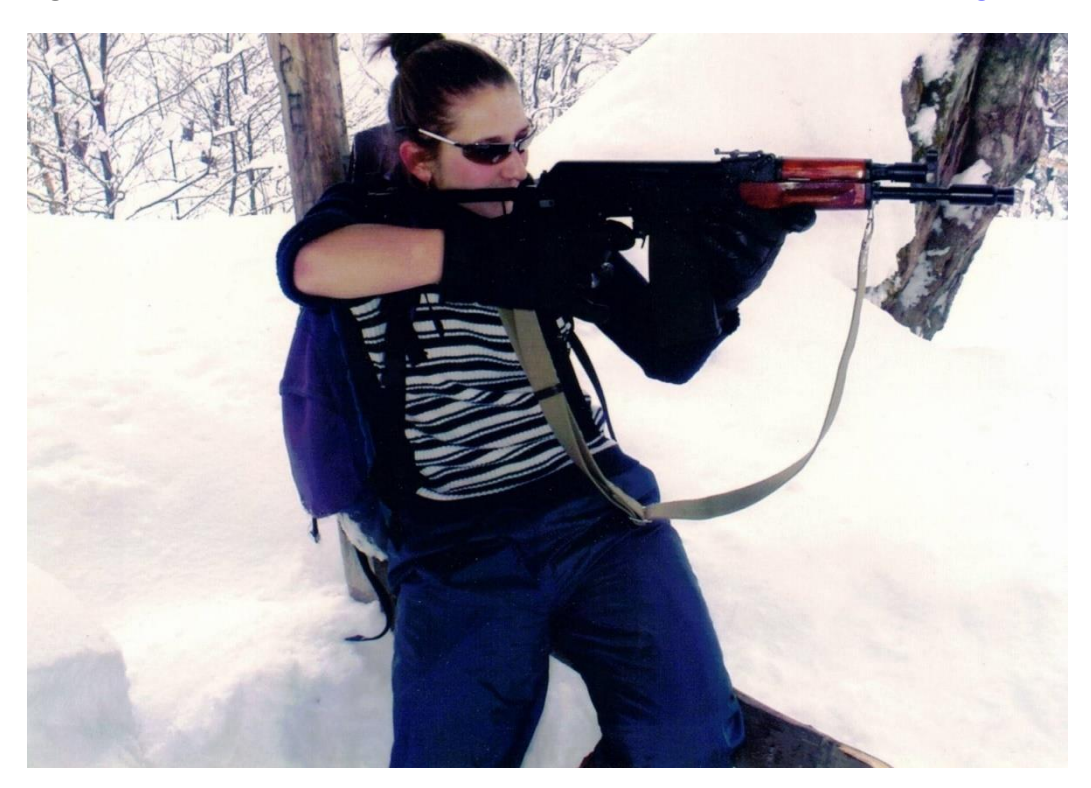
Fig. 13. Fire exercises. February 2005

Unfortunately, this carbine did not differ by aimed shooting, the spread of bullets was significant. Nevertheless, fire exercises were conducted even in winter (Figure 13).