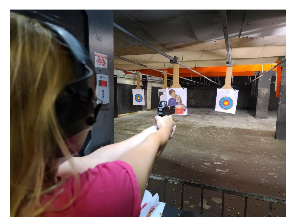
Fig. 18. Shooting from a Glock pistol with a collimator sight. August 2, 2022 As well as shooting from an AR-15 with an open sight (Figure 19).

In 2022, a Glock pistol with a collimator sight was used in practical classes (Figure 18).