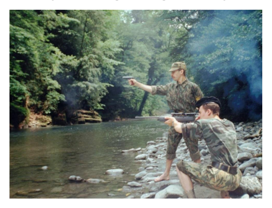
Fig. 10. Firing line. Targets on the other side of the river. July 1997

Firing lines were set up in various places, including other side of the river (Figure 10).