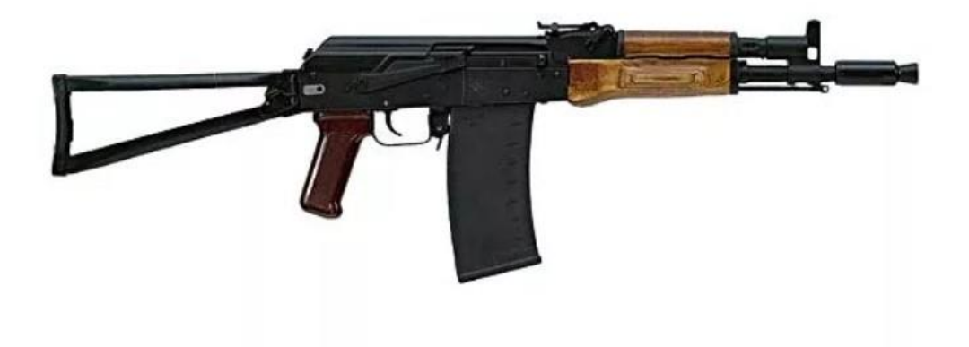
Fig. 12. "Saiga" 410 K smooth-bore carbine

Unfortunately, this carbine did not differ by aimed shooting, the spread of bullets was significant. Nevertheless, fire exercises were conducted even in winter (Figure 13).