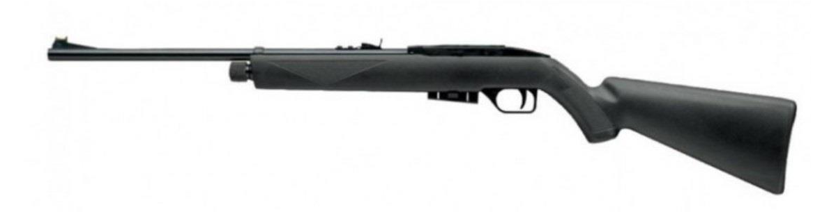
Fig. 1. Crosman 1077 air rifle

The resumption of regular classes began in September 1996. Specially for these purposes, the Kalashnikov assault rifles and a 12-charge Grosman 1077 air rifle (Figure 1) with an optical sight were purchased.