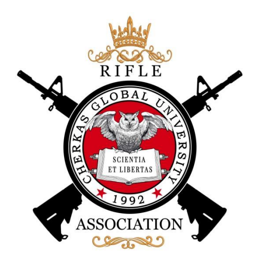
Fig. 20. Rifle Association Logo of the Cherkas Global University

Furthermore, the Rifle Association logo was approved (Figure 20).