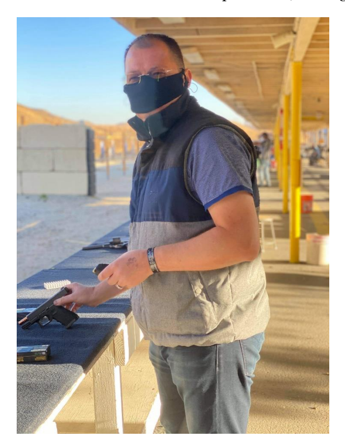
Fig. 17. At the shooting range. October 2021

There were also used the open areas (shooting ranches) for practice (Figure 17).