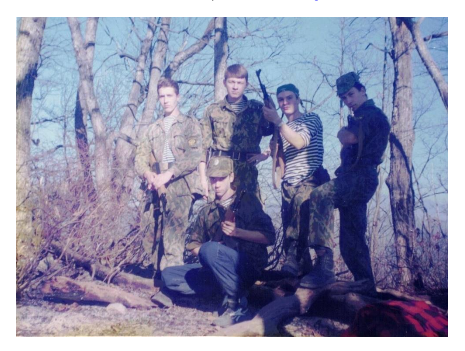
Fig. 3. The second field exit. Semenovsky Spire Mountain without green coating. November 17, 1996

On November 17, 1996, the second field trip to the Semyonovsky Spire Mountain took place. The day before there was a fire on the mountain, the chestnut forests were burning, as a result, the ascent was in extraordinary conditions (Figure 3).