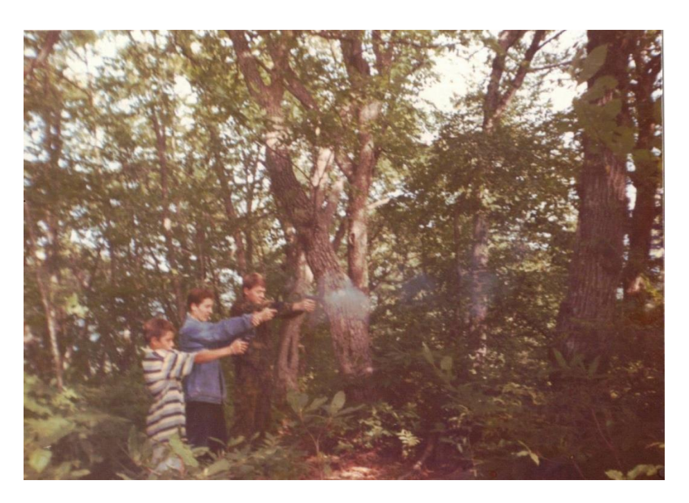
Fig. 2. The first field exit. Shooting training classes on the Semyonovsky Spire Mountain. September 6, 1996

On November 17, 1996, the second field trip to the Semyonovsky Spire Mountain took place. The day before there was a fire on the mountain, the chestnut forests were burning, as a result, the ascent was in extraordinary conditions (Figure 3).