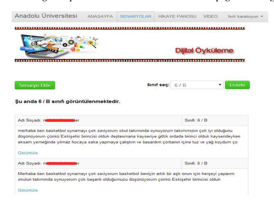
Figure 2. Digital Storytelling webpage screenshot

Figure 2 presents a screenshot of the scenario page of the Digital Storytelling Webpage.