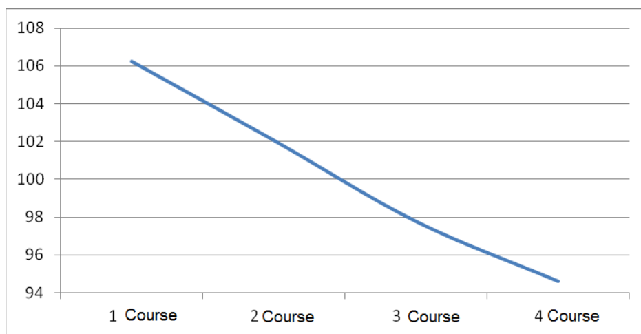
Drawing 1. Dynamics of formation of cognitive style "reflexivity-impulsivity"

First, the dynamics of cognitive style formation is characterized by gradual transition from impulsivity to reflexivity of solving problems for each course. Assessing differences between the courses, we have found out that for each course changes are quantitative in nature (differences between the courses were not statistically reliable – p > 0,05 ). Qualitative, natural changes occur only after the second year of study, when differences between impulsivity and reflexivity are statistically reliable at a high level of significance – p \leq 0,001 .