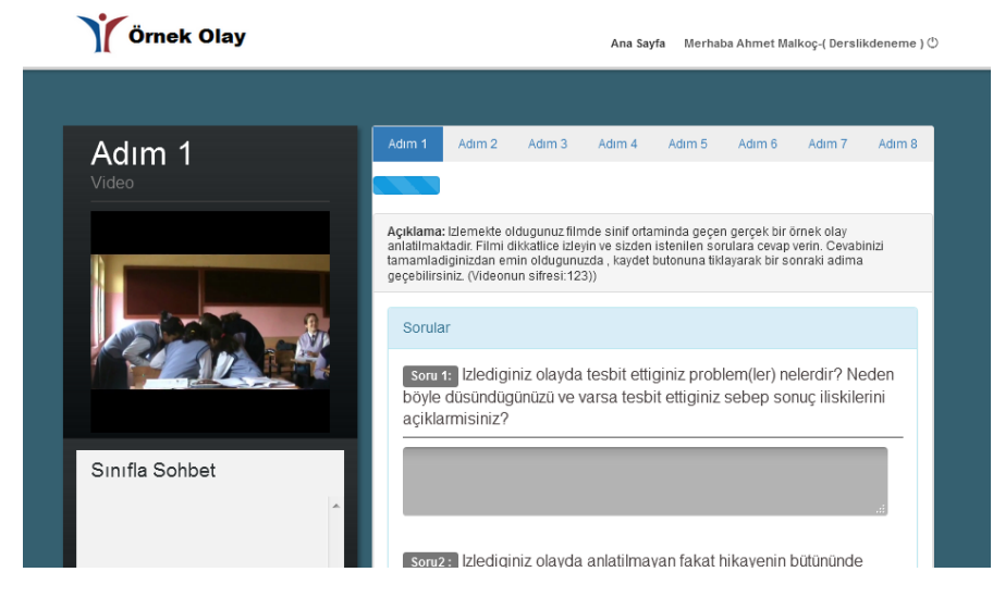
Figure 2.1 A view from online learning environment

The study was conducted with pre-service classroom teachers who were enrolled in a mandatory course namely "Classroom Management". The aim of the course is to improve preservice teachers' pedagogic knowledge. They were taking classes in four groups. Two groups were randomly selected as experimental and two groups were control group. The same teacher educator was conducted lesson in both group using same methods. Pre-service teachers in experimental group were also participated in online case-based learning activities. These activities were conducted on a webpage (http://ornekolay.amasya.edu.tr/). Pre-service teachers used this webpage by logging in with their user name and password. For 10 weeks, they watched 10 video-cases and investigated them using eight-step problem solving approach (Saltan, Özden, 2010). The teacher educator also had an account to monitor and facilitate pre-service teachers while they were investigating the cases. A screenshot of the web page is seen below in Figure 2.1.