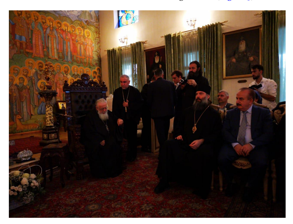
Fig. 5. Catholicos-Patriarch of All Georgia Ilia II, left, in the company of Congress participants. Tbilisi, Georgia, September 29, 2018

On September 29, 2018, as part of the Congress's activities program, a visit was made to the residence of Catholicos-Patriarch of All Georgia Ilia II (Figure 5).