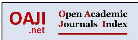
Fig. 2. Logo for Open Academic Journals Index

On July 4, 2013, the work on creating the website was over and the first journal was placed on the OAJI platform – it was Bylye Gody , published by Cherkas Global University Press. Later on, other such journals followed suit (Academic Publishing..., 2014: 11). By August 19 of the same year, more than 100 journals from three countries (India, Iran, and Russia) had been added to the platform.