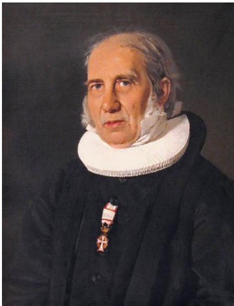
Fig. 1. Nikolaj Frederik Severin Grundtvig

In the middle of the 19th century, European pedagogy was dominated by two pedagogical trends, liberal and conservative one. A prominent figure in Denmark's conservative pedagogy was a Danish priest, writer and philosopher Nikolaj Frederik Severin Grundtvig (1783–1872) (Figure 1).